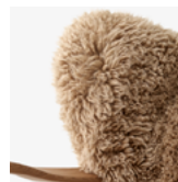
*Sheepskin Honey 50 mm