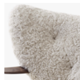
*Sheepskin Moonlight 17mm